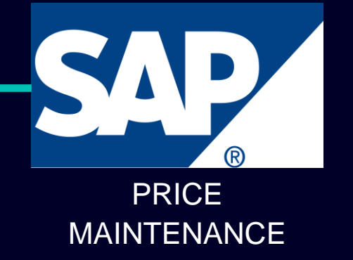
...@digital procurement solution