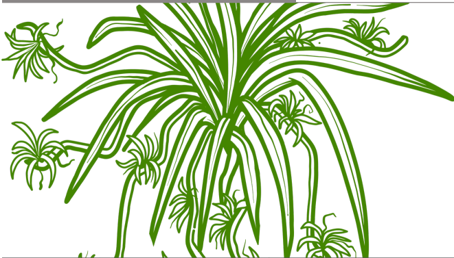
Figure 1: AI Grows Like a Spider Plant

Scaling AI means growing the value created by a core trained model and its recontextualized models.